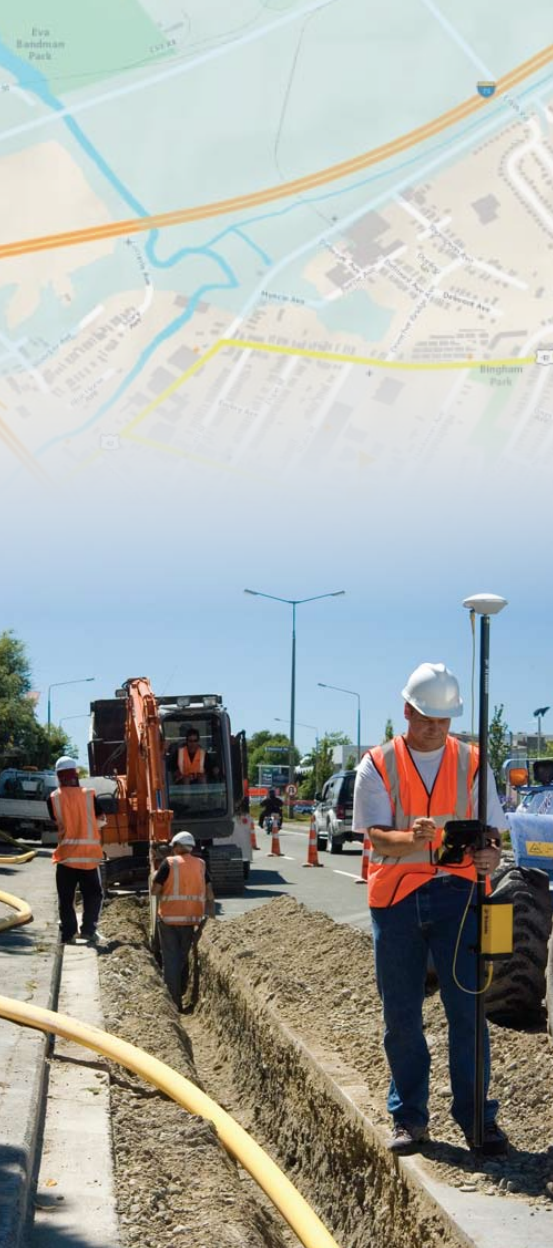
Capturing accurate infrastructure data in advance of emergencies is crucial to effective response.